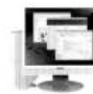
Middleware server application