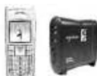
communicate via mobile or modem